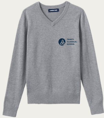
Boys Cotton Modal Fine Gauge V-neck Sweater* Pewter Heather (logo required)