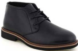
Leather Dress Shoes Black or Brown