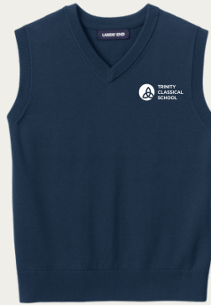
Fine Gauge Sweater Vest* Classic Navy (logo required)