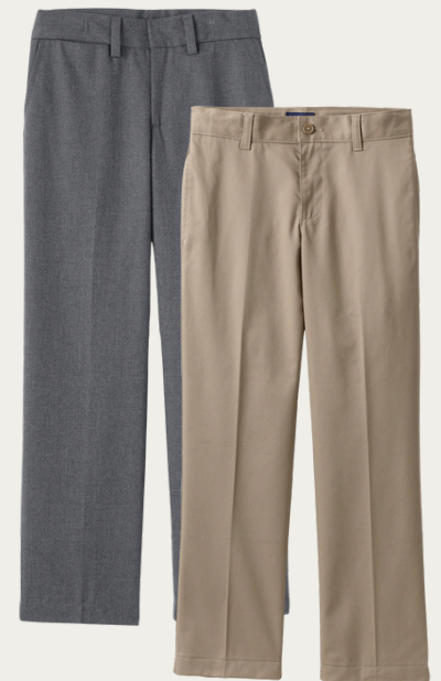
Boys Plain Front Chino Pants Gray or Khaki