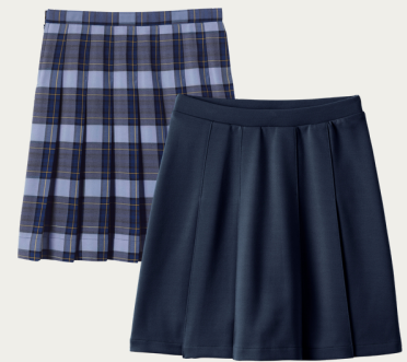
Girls Box Pleat Skirt* Classic Navy Plaid or Navy