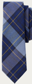
Tie* Classic Navy Plaid