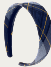
Wide Headband* Classic Navy Plaid (optional)

*Sweater, jumper, skirt, and headband must be purchased through Lands' End. All other dress uniform items may be purchased elsewhere or through Land's End.