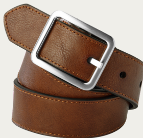
Leather Belt Black or Brown

*Sweater, vest, fleece and tie must be purchased through Lands' End. All other uniform items may be purchased elsewhere or through Land's End.