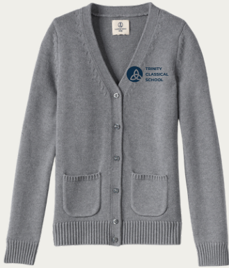
Girls Cotton Modal Button Front Cardigan Sweater* Pewter Heather (logo required)