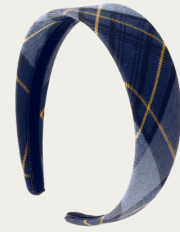
Wide Headband* Classic Navy Plaid