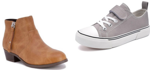
Street Shoes/Flats/Ankle Boots