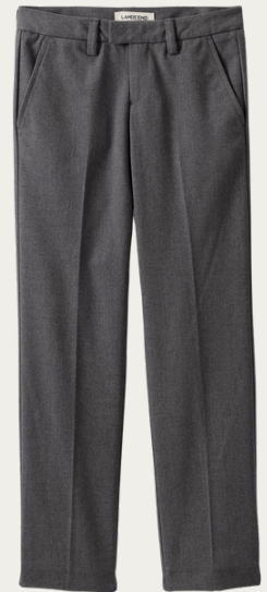
Girls Plain Front Chino Pants Gray