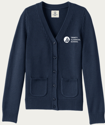
Girls Cotton Modal Button Front Cardigan Sweater* Classic Navy (logo required)