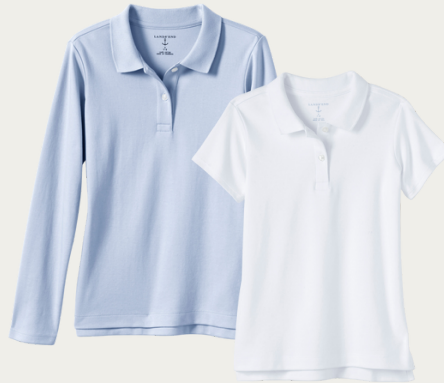
Girls Short or Long Sleeve Polo Shirt White or Blue