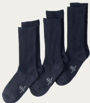
Crew Socks Black or Navy