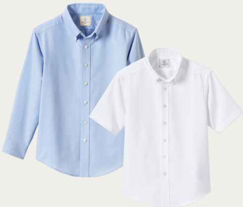
Boys Long or Short Sleeve Oxford Shirt White or Blue