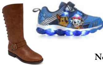
No slippers No Uggs, No Knee high boots No Light-Up/ wheels/etc.