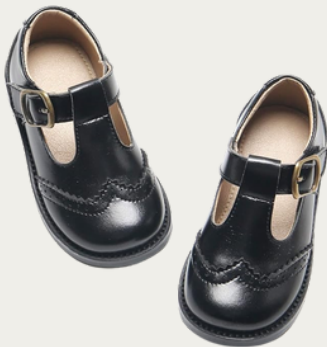
Dress Shoes Navy or Black