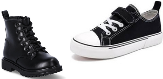
No Cloth No Boots