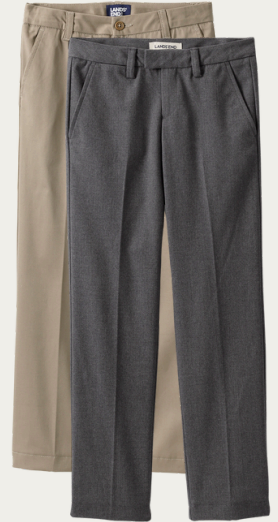
Girls Chino Pants Gray or Khaki