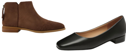
Leather Dress Shoes/Ankle Boots 2" Heel or Less Brown or Black