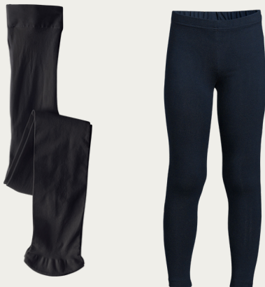
Tights or Leggings Navy or Black