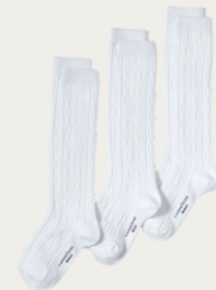
Knee Socks White