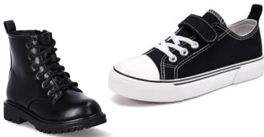
No Cloth No Boots