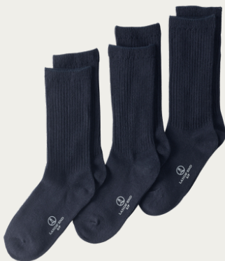
Crew Socks Black or Navy