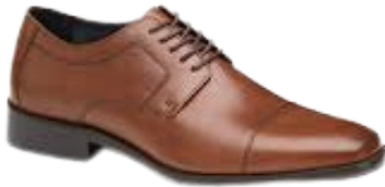
Leather Dress Shoes Black or Brown