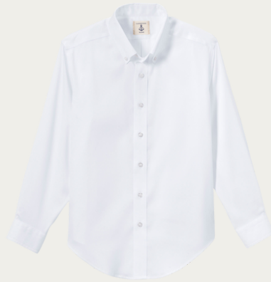
Boys Long Sleeve Oxford Shirt White