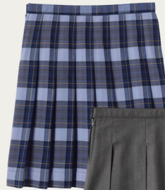
Girls Box Pleat Skirt* Classic Navy Plaid or Gray