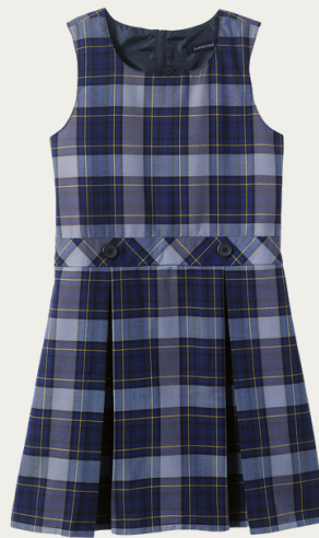
Girl's Plaid Jumper* Classic Navy Plaid