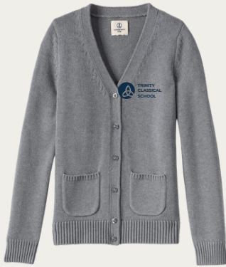
Girls Cotton Modal Button Front Cardigan Sweater* Pewter Heather (logo required)