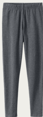
Girls Legging Charcoal Heather