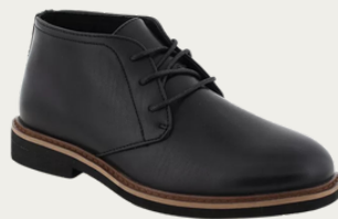
Dress Shoes Black or Navy

*Sweater, vest, and tie must be purchased through Lands' End. All other dress uniform items may be purchased elsewhere or through Land's End.