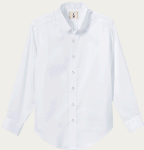
Boys Long-Sleeve Oxford Shirt White