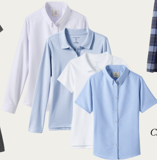
Girls Short or Long Sleeve Oxford or Polo Shirt White or Blue