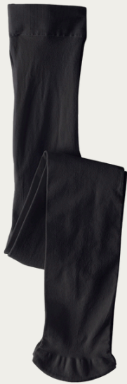
Tights Navy or Black