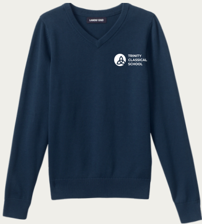
Boys Cotton Modal Fine Gauge V-neck Sweater* Classic Navy (logo required)