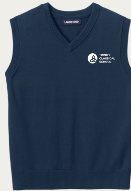
Boys Cotton Modal Fine Gauge Sweater Vest* Classic Navy (logo required)