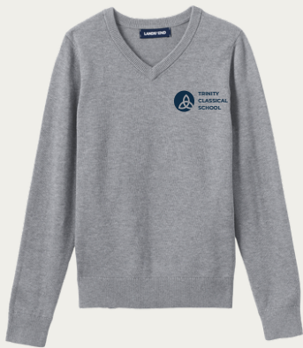
Boys Cotton Modal Fine Gauge V-neck Sweater* Pewter Heather (logo required)