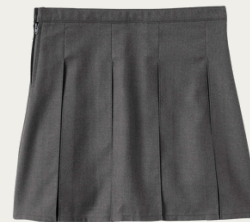
Girls Box Pleat Skirt* Gray