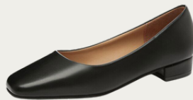
Dress Shoes Navy or Black

*Sweater and dress must be purchased through Lands' End. All other dress uniform items may be purchased elsewhere or through Land's End.