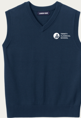
Boys Cotton Modal Fine Gauge Sweater Vest* Classic Navy (logo required)