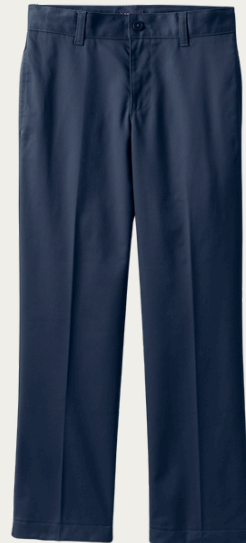
Boys Plain Front Chino Pants Classic Navy