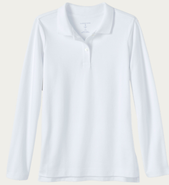
Girls Long Sleeve Polo Shirt White