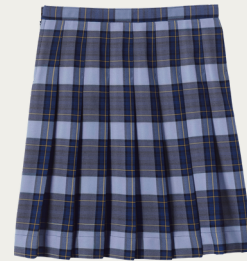
Girls Plaid Box Pleat Skirt* Classic Navy Plaid