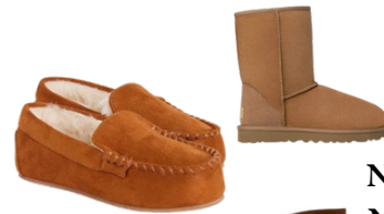
No slippers No Uggs, No Knee high boots No open-toed shoes