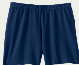
Girls Cartwheel Shorts Navy

*Sweater, jumper, skirt, and headband must be purchased through Lands' End. All other uniform items may be purchased elsewhere or through Land's End.