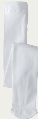
Footed Tights White