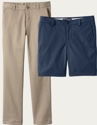
Girls Chino Pants and Shorts Navy and Khaki