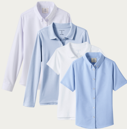
Girls Short or Long Sleeve Oxford or Polo Shirt White or Blue