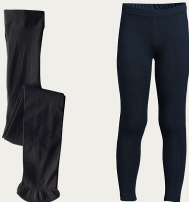
Tights or Leggings Navy or Black