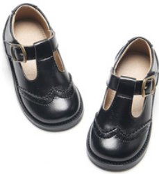
Leather Dress Shoes/Ankle Boots Brown or Black