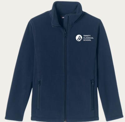
Full-Zip Mid-Weight Fleece Jacket* Classic Navy (logo required)