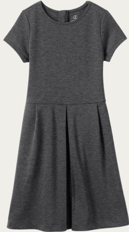
Girls Short Sleeve Ponte Dress* Charcoal Heather