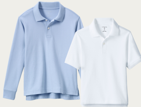
Boys Long or Short Sleeve Polo Shirt White or Blue