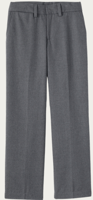
Boys Plain Front Chino Pants Gray