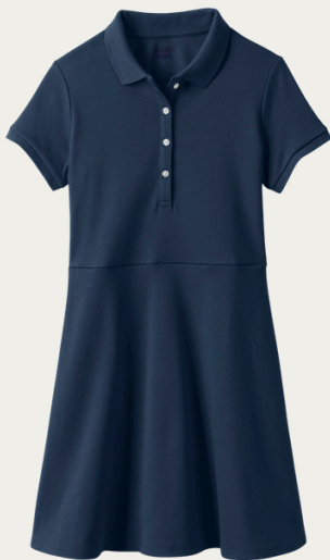
Girls Short Sleeve Interlock Polo Dress Classic Navy