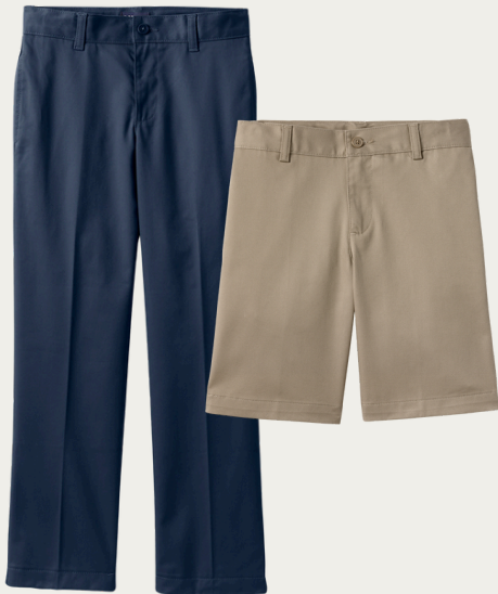
Boys Plain Front Chino Pants or Shorts Navy or Khaki