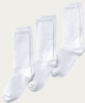
Crew Socks White